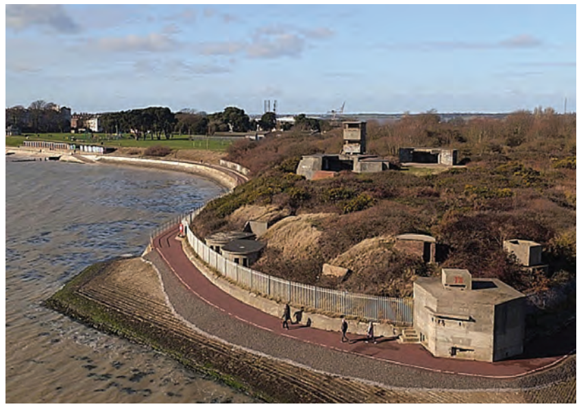
Beacon Hill Fort, Harwich.

The fort was decommissioned in 1956 and all artillery removed. By the late 1960s, its military presence consisted of one soldier for 24 hours, one day a year. Hence the ease of access by my children until it was more securely fenced off. The site was sold in the 1970s and there were plans by the owners to build a hotel on the site. This was resisted by local residents