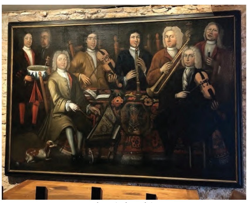
The Gestingthorpe Choir.

Bendor Grosvenor, The Gestingthorpe Choir: Re-identified, Art History News (5th April 2020).