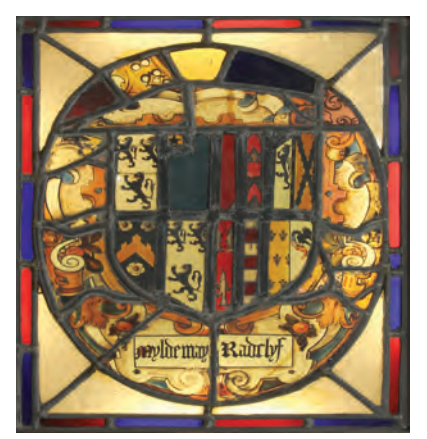
The arms of Mildmay impaling Radcliffe.

The remaining two panels, however, are of greater interest, and they both helpfully include the names of those commemorated: 'Waldegrave Myldemay' and 'Myldemay Radclyf'.