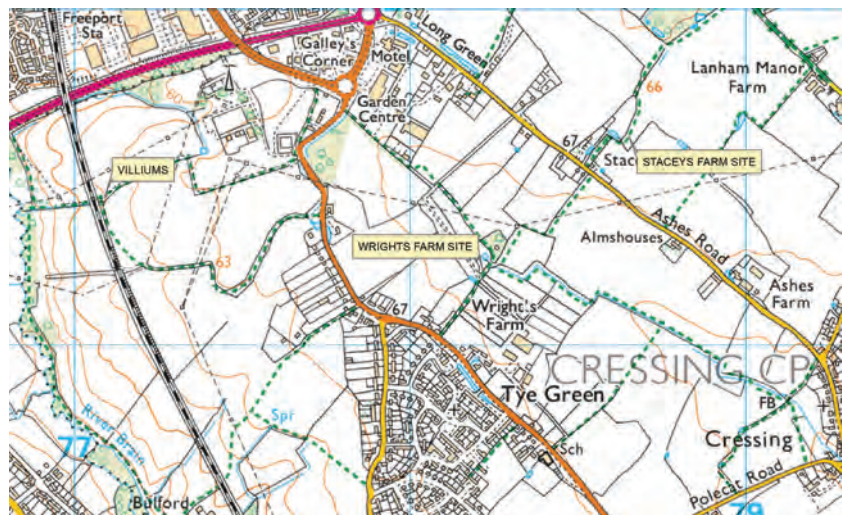
Staceys Farm, Villiums and Wights Farm, at Tye Green, Cressing.

Our walks around Cressing have identified a number of new sites that maybe medieval in origin. On the western side of the Braintree to Witham