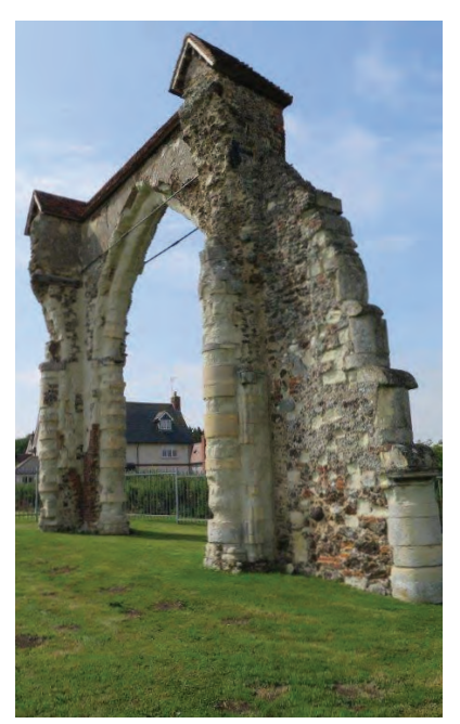
Bicknacre Priory.