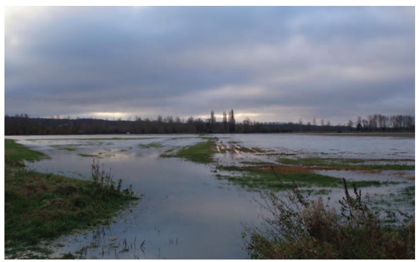
Risley Mead in winter when it floods, looking south from below the lynchet on its northern boundary, the Chelmer is 0.5km away where the cricket bat willows lining its banks can just be seen in the misty middle distance.

divided in that way with various, often quite distant, farms owning strips of meadow land. That system survived into the mid-20th century as this account of another of the Chelmer valley's former meadows indicates 'No description of the farm fields would be complete without mention of Cuton Mead which is some four miles away past the hamlet of Brook End. It is a large stretch of mead land divided up into strips of various sizes which are allotted to various farms in the district. Our share is ten acres, which are bought with the farm as part of it. They give an excellent crop of hav, and moreover one may graze two cattle per acre from the 12th August to 12th October. Cuton is the object of an annual expedition for which everyone prays for good weather so that it may be briefly concluded and the hay brought safely home' (Smith (1948)).