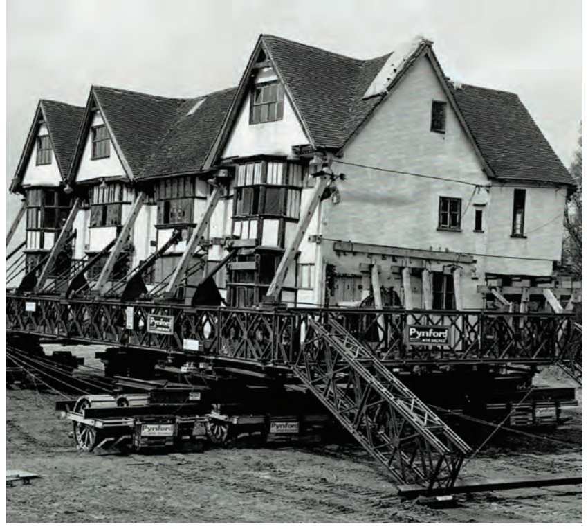
Ballingdon Hall in the process of being moved to its new site (April 1972).