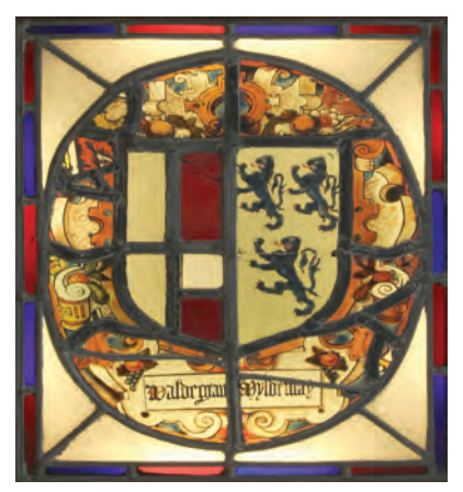
The arms of Waldegrave impaling Mildmay.

Royal Commission on Historical Monuments' Inventory of the Historical Monuments in Essex, 1 (1916), p.348.